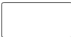
5" x 10" x 1/2" Tumbled