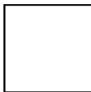
16" x 16" Honed